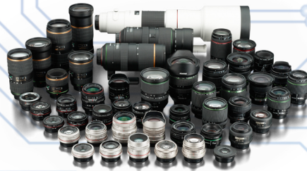
Cinema Lens - Range from 10 mm to 300 mm