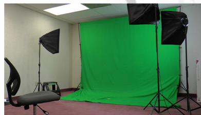
Portable Chroma Studio