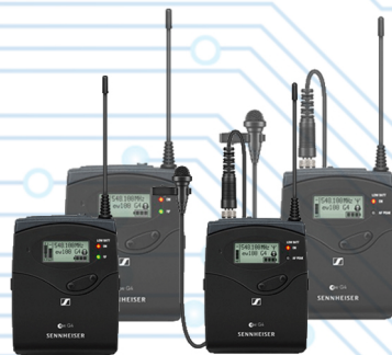
2 pairs of sennheiser lapel microphones for interviews.