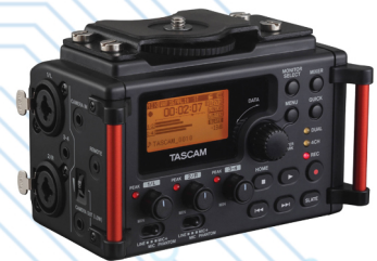
Audio recording for on-set filmmakers & videographers